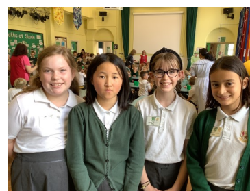
Our star servers!