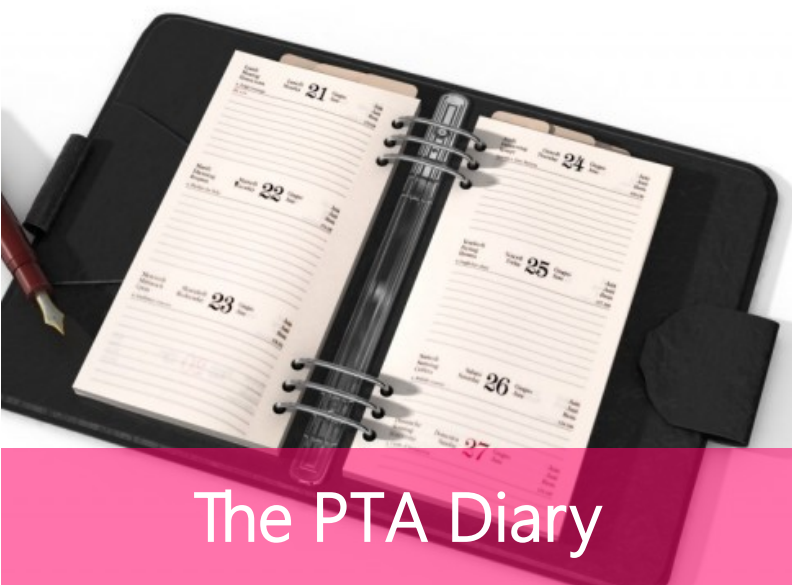
The PTA Diary