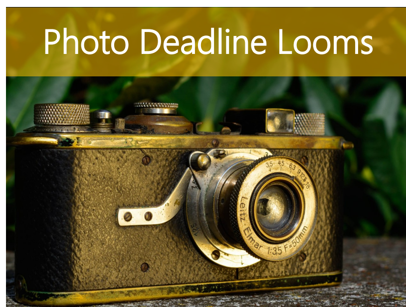
Photo Deadline Looms