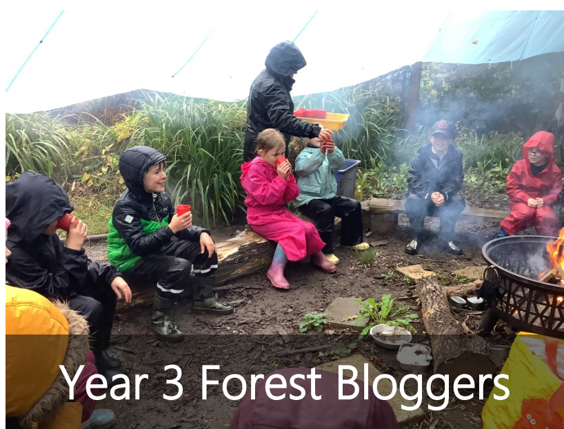
Year 3 Forest Bloggers

On page 13 of today's newsletter, you will see next term's Forest School timetable, which is already reflected on our online diary.