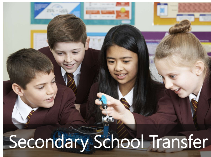
Secondary School Transfer

Parents should expect to hear the result of their allocated school during the day via email from KCC Admissions on Monday 3 March 2025.