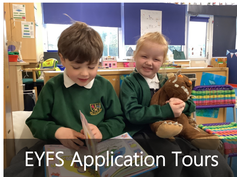
EYFS Application Tours

Please be aware that we will be particularly busy between 09:00 and 11:30, so you may wish to avoid these times if you need to make a personal visit to school or telephone with a non urgent matter