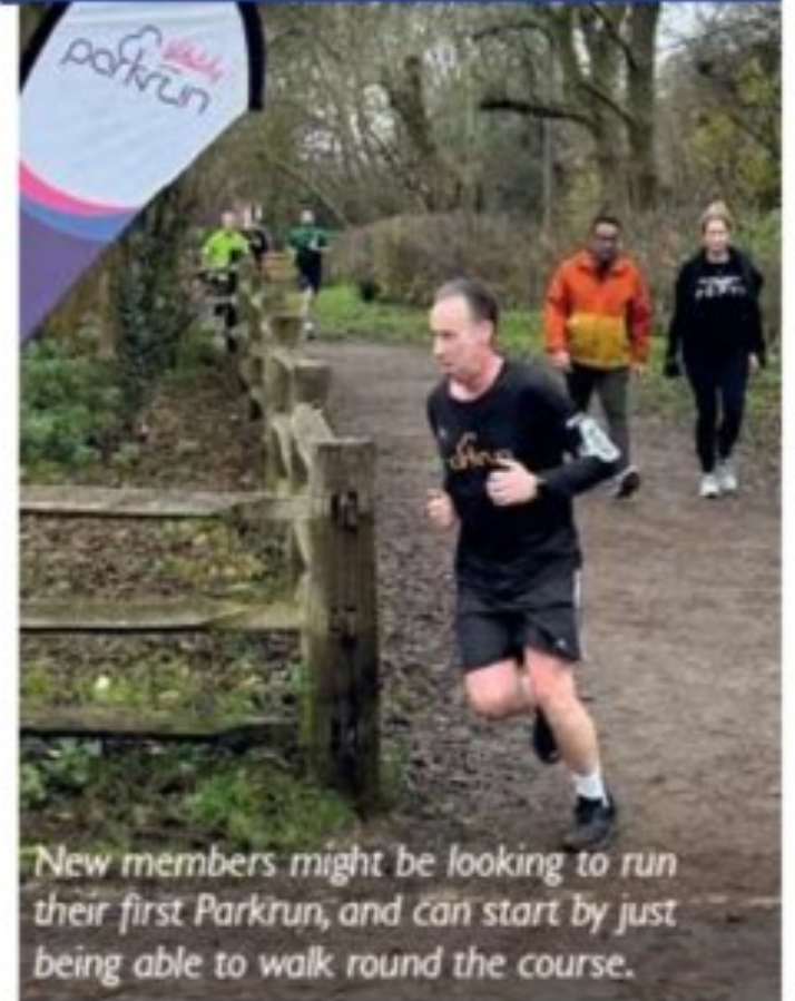
New members might be looking to run their first Parkrun, and can start by just being able to walk round the course.

New joiners don't need to do three sessions per week, we know people have busy lives and can't always make each night, but we would like our beginners to try to make two sessions per week.