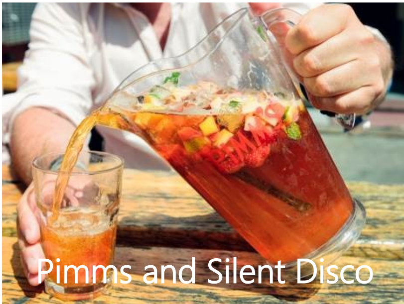
Pimms and Silent Disco