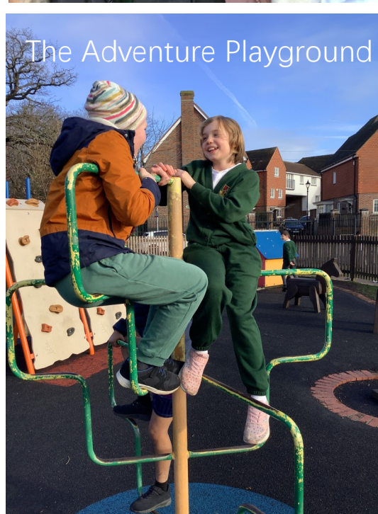
The Adventure Playground