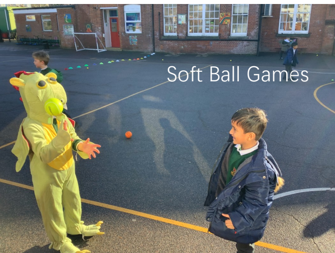
Soft Ball Games