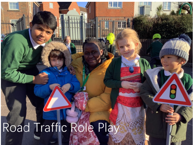
Road Traffic Role Play