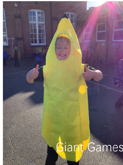
Giant Games, Stilts and Dressing Up