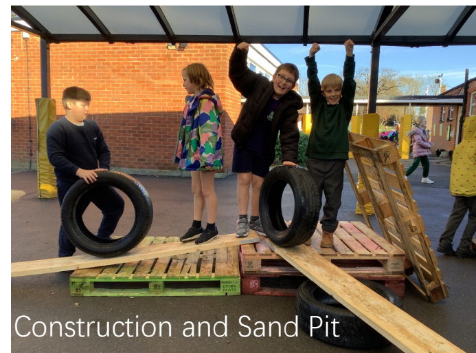
Construction and Sand Pit