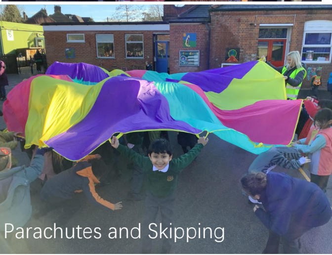
Parachutes and Skipping