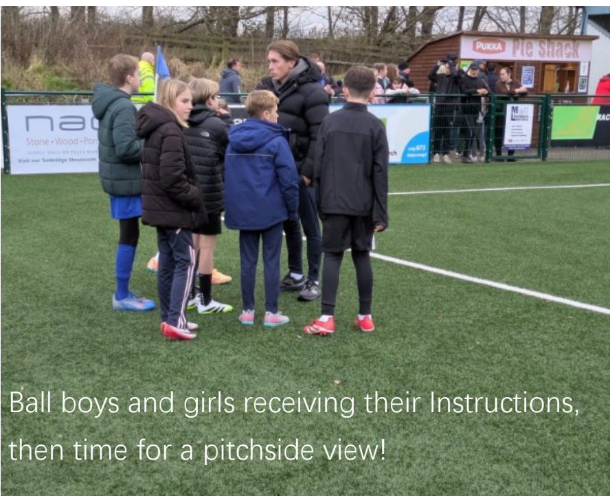
Ball boys and girls receiving their Instructions, then time for a pitchside view!

'The half-time challenge was a lot of fun to take part in, we competed against St Matthew's School and we were good enough to win! There were three small goals: Red (which you got 5 points for scoring in), Green (10 points) and Black (20 points). We had to try and get the ball in the red net, then the green net and then black on each of our turns and if you missed, you had to go back to the beginning and score in red again! The challenge was made harder in that you only had 90 seconds to play in! The Slade team scored most points and we won. Most of us from Slade were used to playing at the Yeomans Community Stadium at Longmead as we have played tournaments and done soccer schools and training on the pitch so it was a familiar and friendly environment; we all got in the zone quickly, so it was easy to beat any nerves about playing in front of nearly 2000 people!'