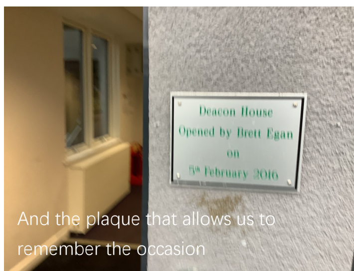
And the plaque that allows us to remember the occasion